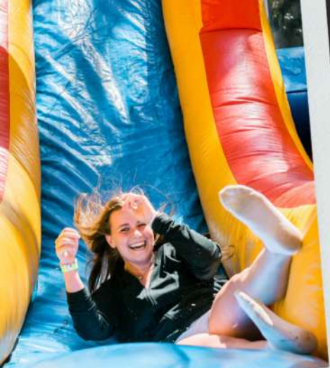
Life at WPU!